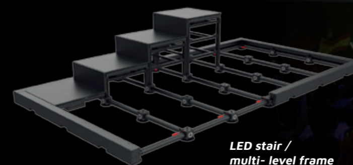
LED stair / multi-level frame

Black Marble LED panels can be built as LED floor, LED wall, stairs and multi-level stages and integrate this all. This thought-through system is very easy to install and enables users to apply their creative applications freely and enables the application of a variety of creative designs.